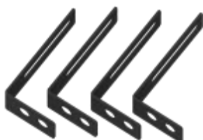
Model: RW-M6.1-B-Fixed support

Details: Pair of 2/0AWG Battery power cable and RJ45 communication cable for battery parallel, both ends have waterproof terminals . The default length is 300mm.